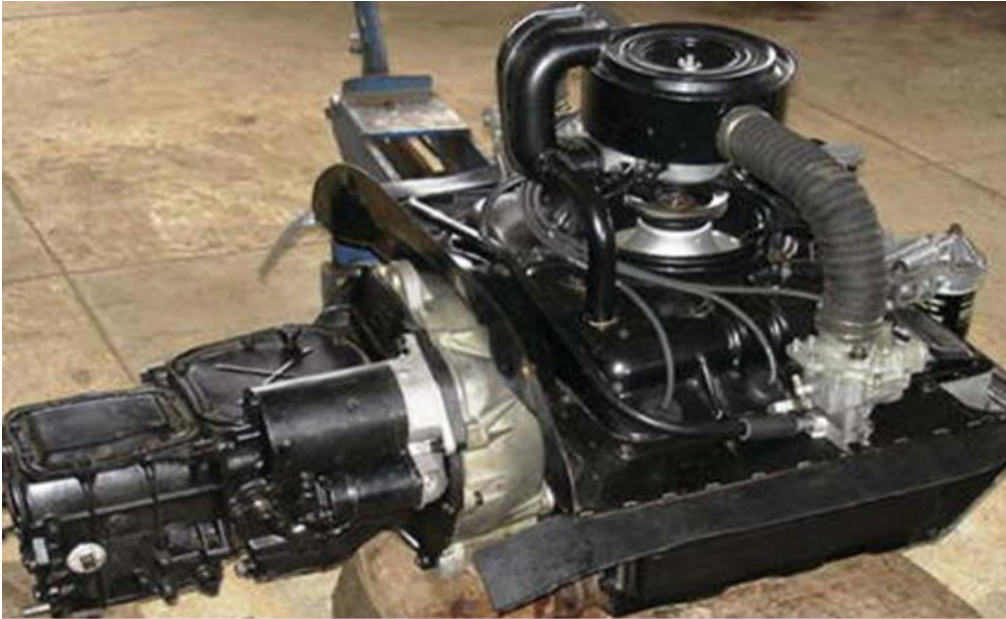
Image above is a Corvair Early Model Engine