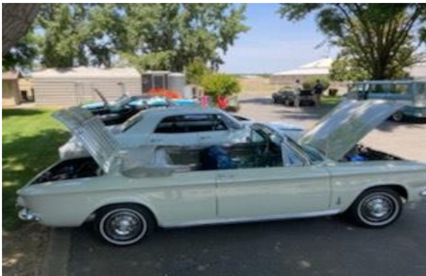
Photo: CCRC 2023 Annual Picnic