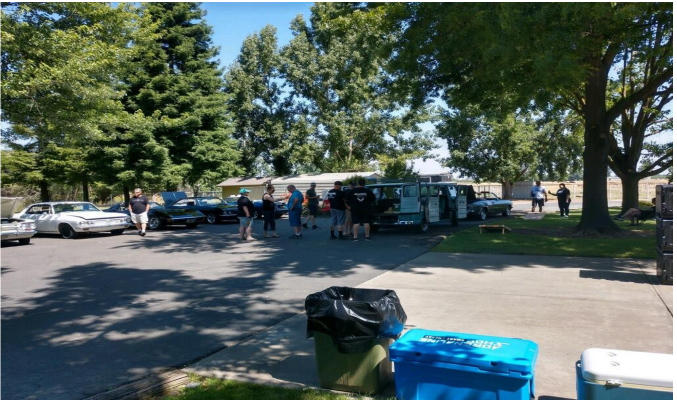
Above Photos from 2023 CCRC Annual Picnic